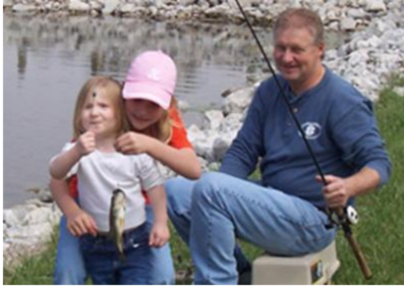
Fishing for children & Seniors, Four Horseshoe pits